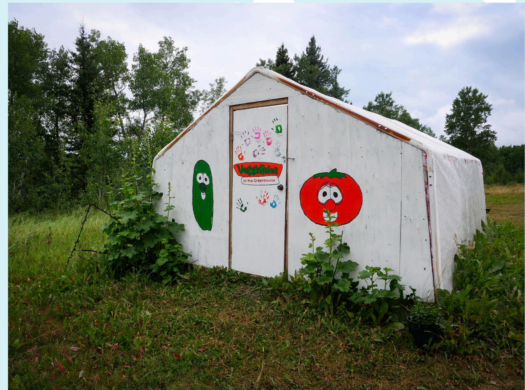
Veggie Tales: Larry the Cucumber, Bob the Tomato, and more.